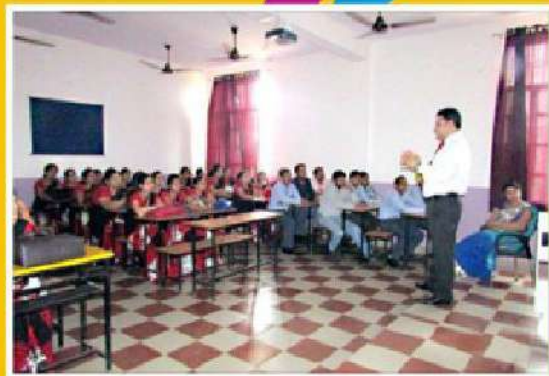
FACULTY DEVELOPMENT SEMINARS