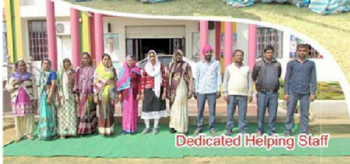
Dedicated Helping Staff