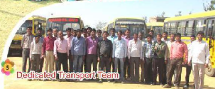
Dedicated Transport Team